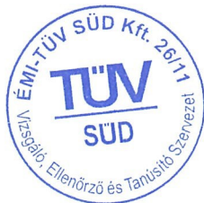
ÁBEL ÁRON ÉMI-TÜV SÜD Kft.